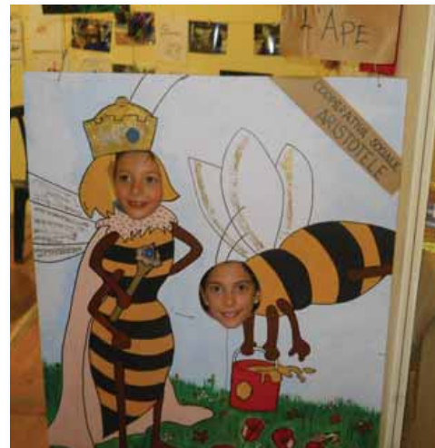
Girls just wanna have fun!