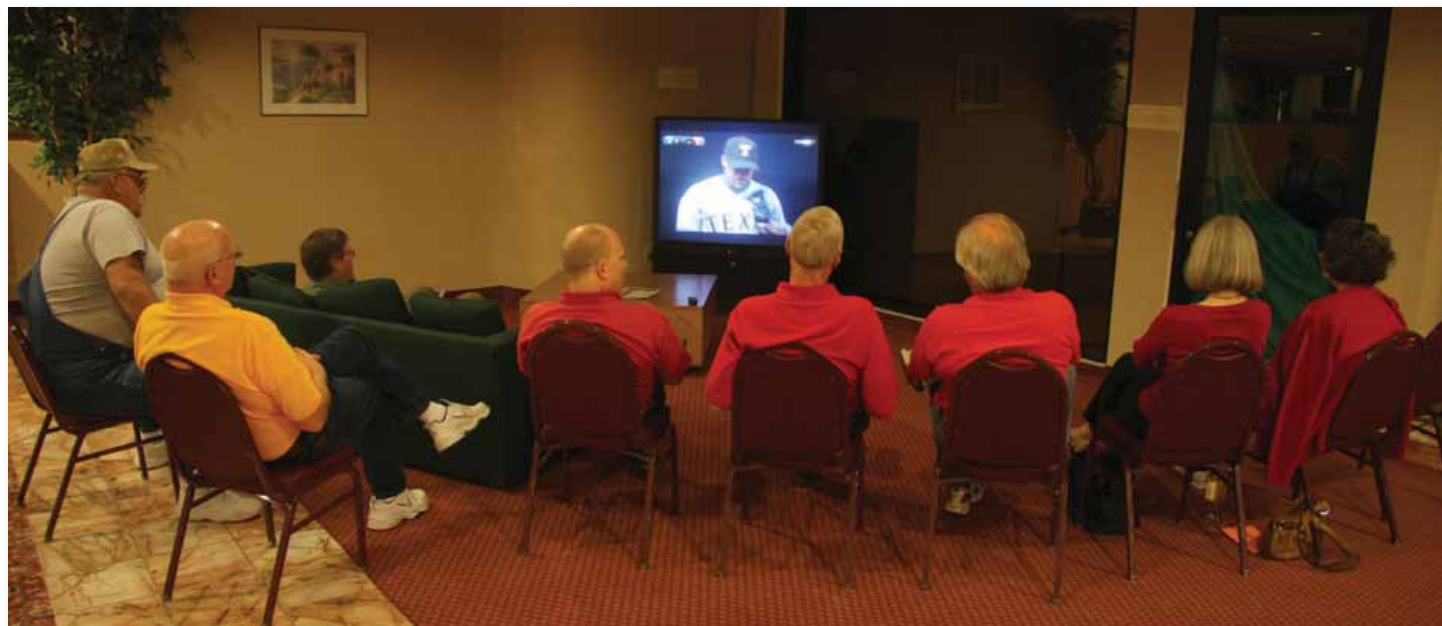
A few diehard baseball fans (mostly from the St. Louis contingent) headed straight from Friday night's banquet to the hotel lounge to watch the Cardinals complete an improbable comeback to win their 11th World Series title.

This newsletter is published six times per year, in even months. Submissions are due by the 15th of the month prior to publication.