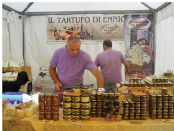
An impressive display of honey products

To quote Marina Marchese, author of Honeybee: Lessons from an Accidental Beekeeper , "Honey has a strong culinary tradition in Italy. It is tasted and evaluated to detect botanical sources as well as to identify certain defects such as fermentation, impurities, off-odors and flavors. Honey is judged in its liquid state, with no extra straining or laborious preparation, just extracted honey, period. Clarity is not an issue. Honey is to be enjoyed for its distinctive flavor profile and harmonious pairings with local cheeses."