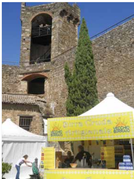
Tents in the fortress